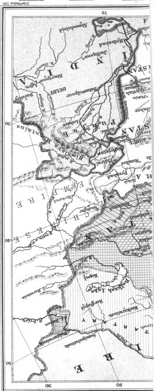
English Miles 0 100 200 400 600